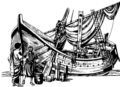
Yoona arariina mu-ryato (1:3)

3 Kasi Yoona uyö akang'osa ukurwa hayö, okore aihëënëri-ho Yehobha. Yairikani nakyo, akang'aaraara igho akahika