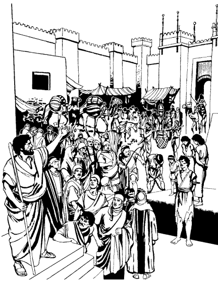
Yoona araraarekera abhantö abha Ninaawi (3:4)

3 Yoona akaikërrya amang'ana agha Yehobha, akatanora, akaghya