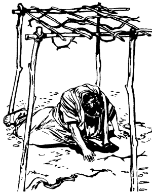
Yoona aratuna aghereke (4:8)

7 Kasi nyinkyo iyaako, mö-röghörö, Waryobha akasëemya rikonde reno renga riise, rekaraaghera imiri ighya rirandoora riyö rekooma